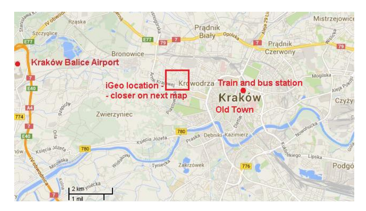
Map of the area of Kraków where the iGeo will be held: